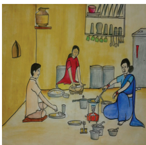
SHREYA PANDAV VIII-B