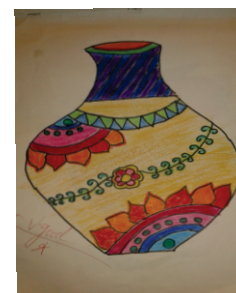
VISHVA DESAI IV-A