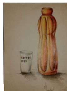
PARI NIRMAL IX-A